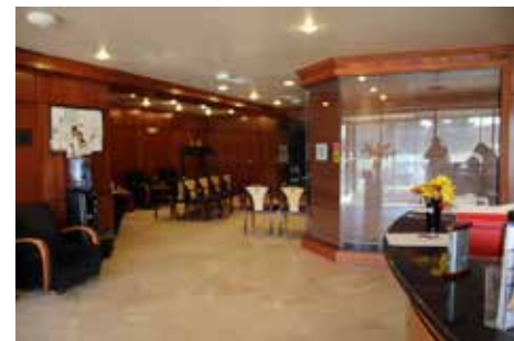
Lasik Vision Interior Build Out Space For Lease.

Brian Starr 414.324.9207 Office 414-223-4000 bstarr@citycommercialre.com